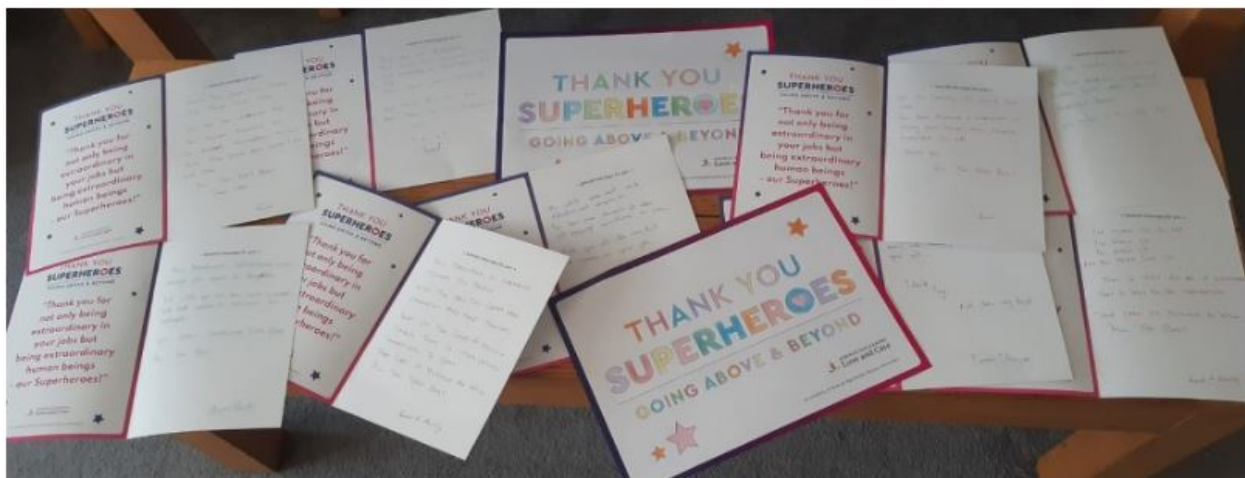
Thank You Cards and Posters

SRLC's campaign offers an opportunity for every one of us to be involved in showing immense gratitude to our superheroes by simply writing Gratitude Cards, sticking up Gratitude Window Signs or helping towards the provision of Gratitude Packs to different sectors of frontline workers each week.