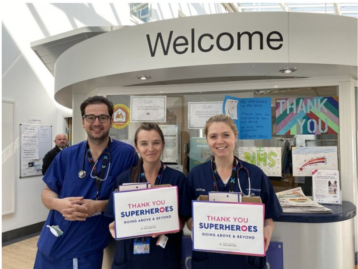
West Middlesex Hospital

Creating a "Great Wall of Gratitude" for our Superheroes - National Superhero Day